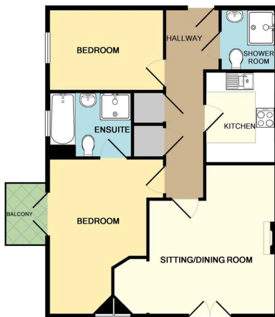
This Floor Plan is for guidance only and is NOT to SCALE Made with Metropix ©2015

Living Room 4.67m (15'4) max x 5.11m (16'9) max into recess