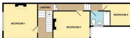
FIRST FLOOR APPROX. FLOOR AREA 537 SQ.FT. (49.6 SQ.M.)

TOTAL APPROX. FLOOR AREA 1184 SQ.FT. (110.0 SQ.M.)