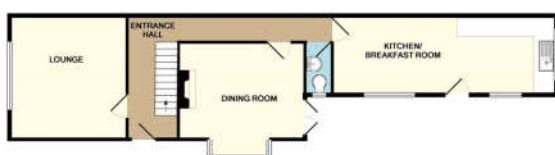
GROUND FLOOR APPROX. FLOOR AREA 547 SQ.FT. (50.1 SQ.M.)