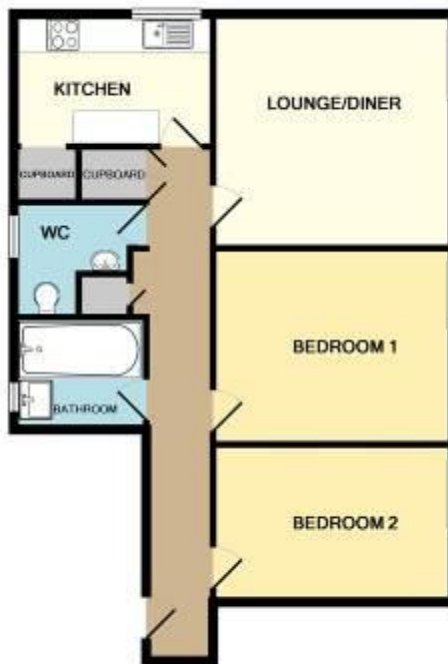
This Floor Plan is for guidance only and is NOT to SCALE Made with Metropix ©2017