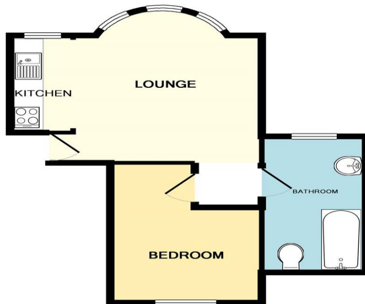
This Floor Plan is for guidance only and is NOT to SCALE Made with Metropix ©2018